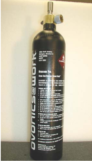
Shown with optional quick-connect coupling. Actual appearance may vary.